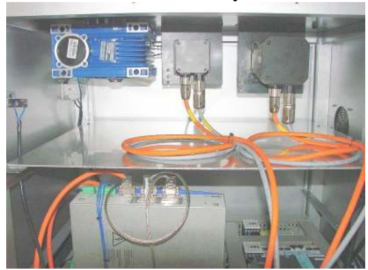
Modern PLC electrostation