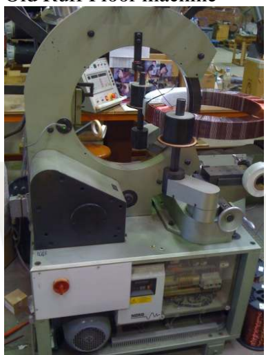
Old controller no more spare parts Controls