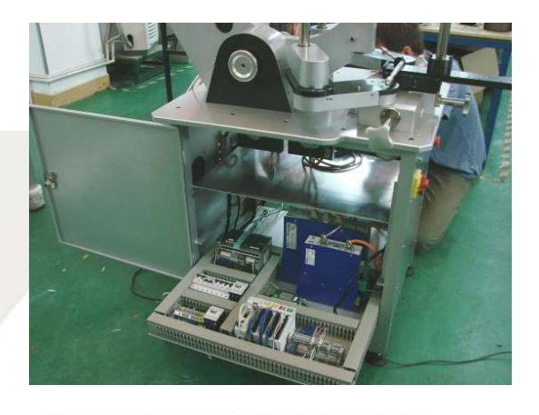
Modern Controller - Touch PC & Hand